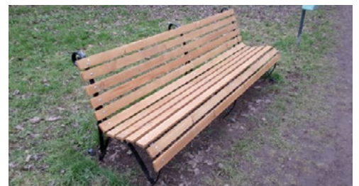
Restored benches on the Burgage and at Riverside

We plan to continue repairing and to install new benches in the town. If you would like to sponsor a new bench or restore an existing one, please get in touch with the Council using the phone or email above.