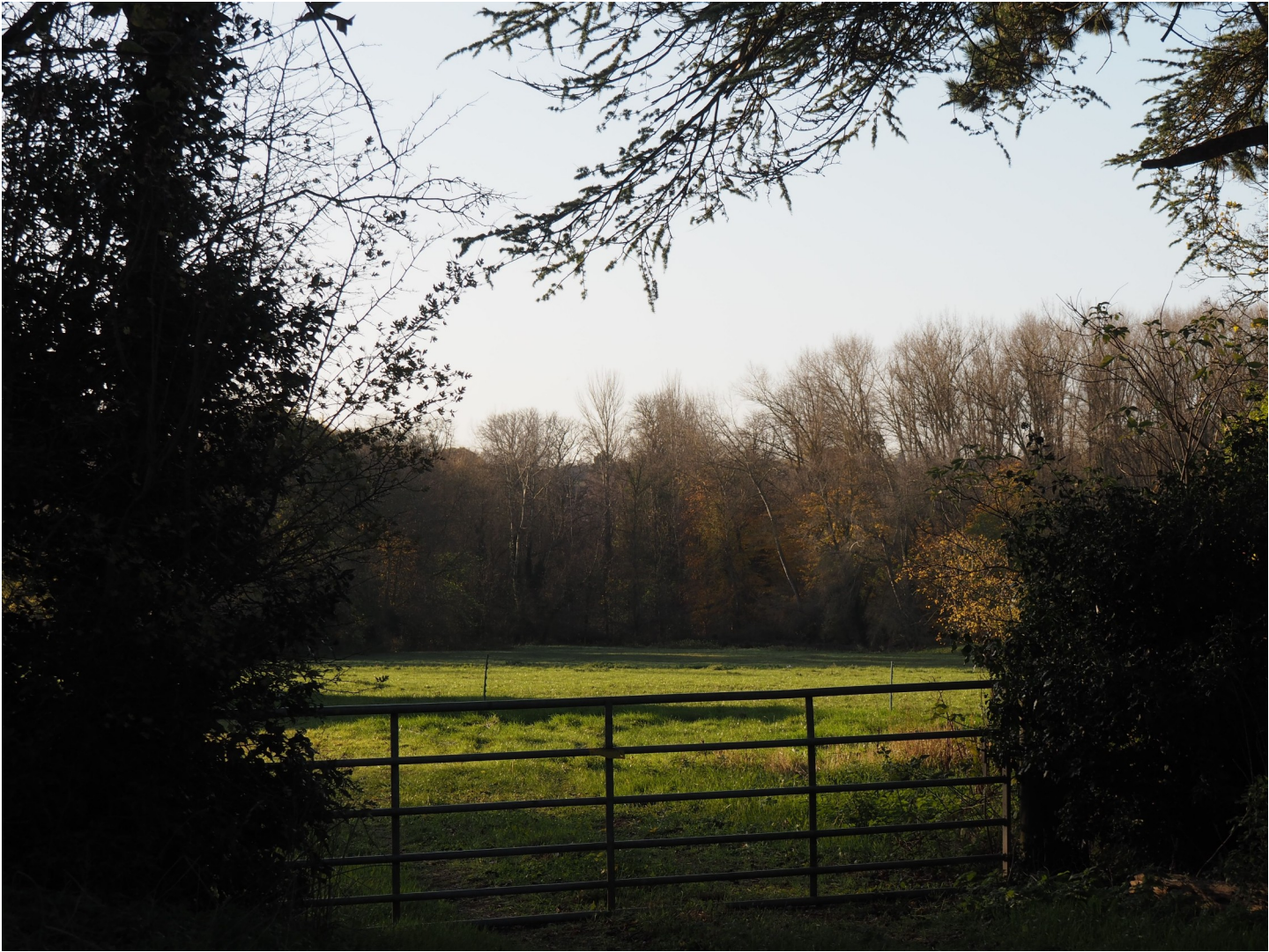
Looking SW from the top Normanton Road back towards Southwell.