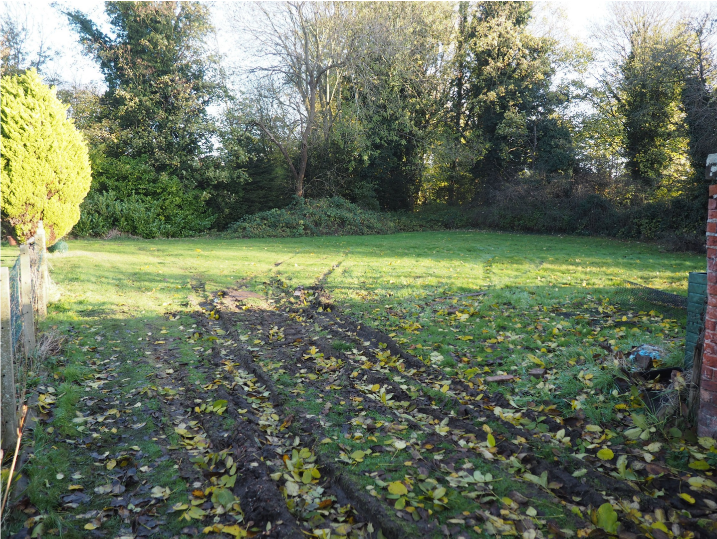
Looking North from the SW corner of the land. The trees in the background line Potwell Dyke.