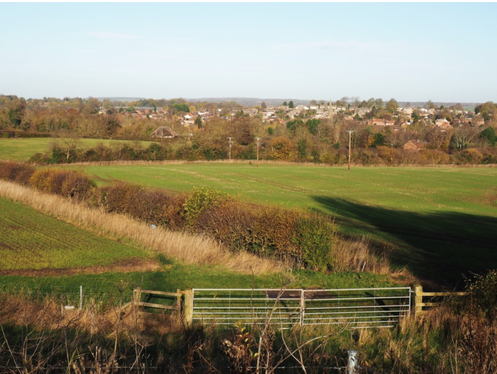
Looking north from Brackenhurst Campus.