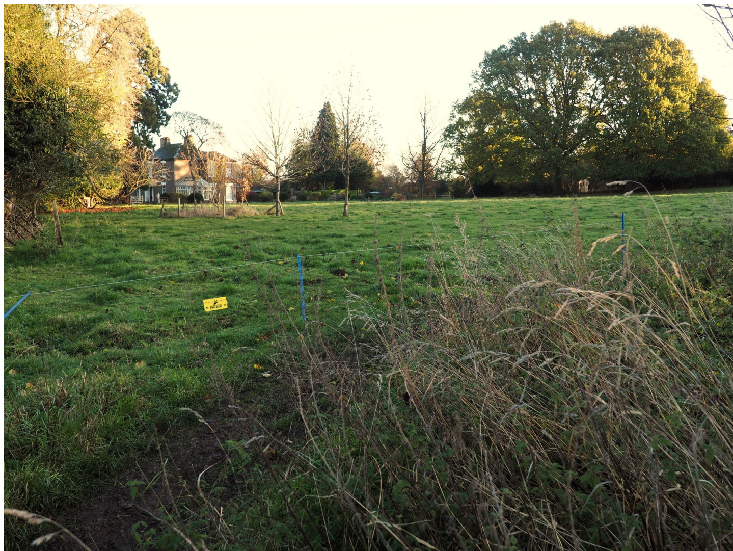
Looking east from the SW corner from the footpath from Farthingate. Easthorpe Court on the left.