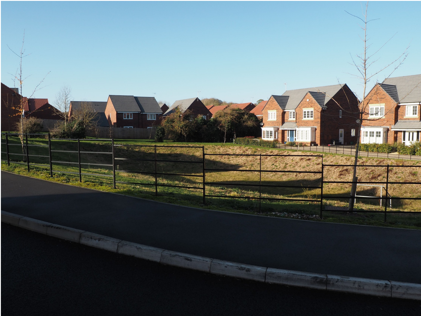
Looking west across the space