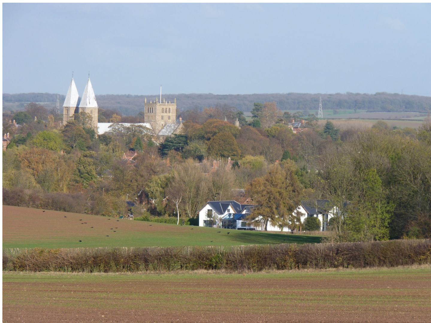
Looking South East towards The Minster