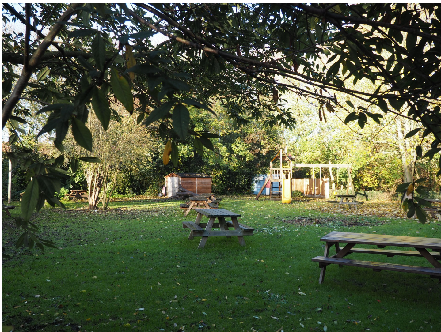
Looking west from Shady Lane across the garden of the Hearty Goodfellow pub. Potwell Dyke is on the right..