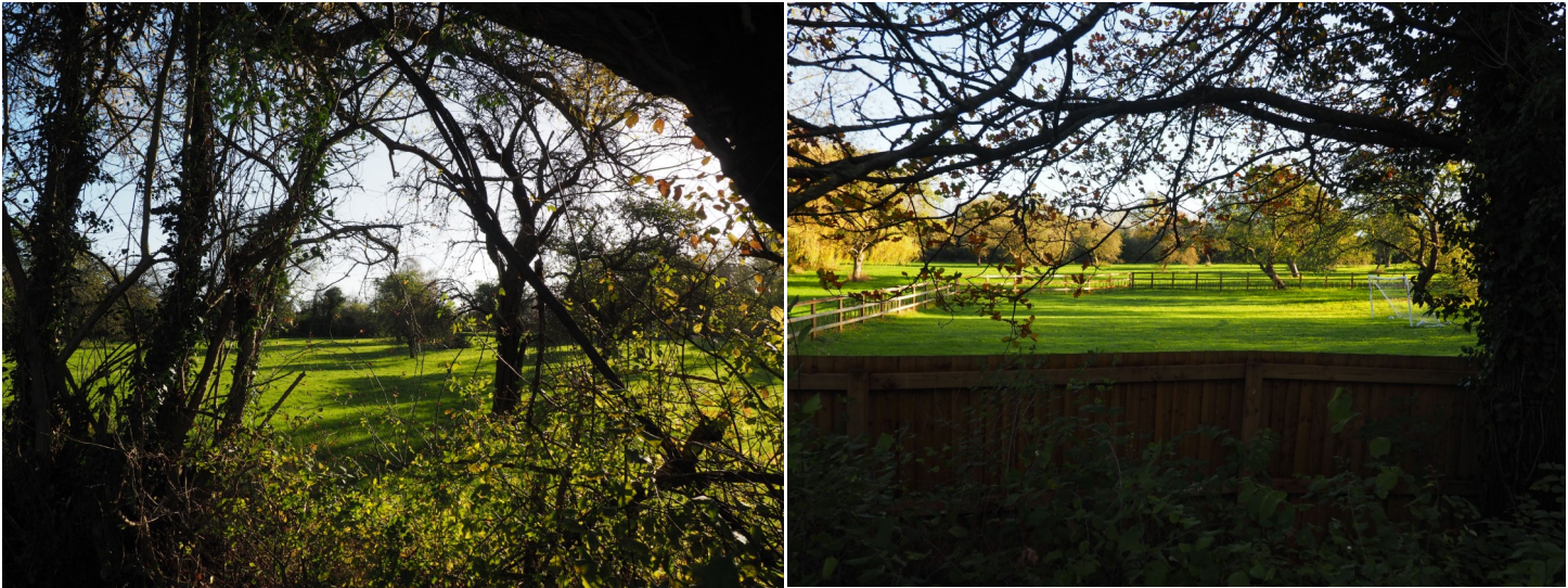
Looking south from the footpath on the north boundary