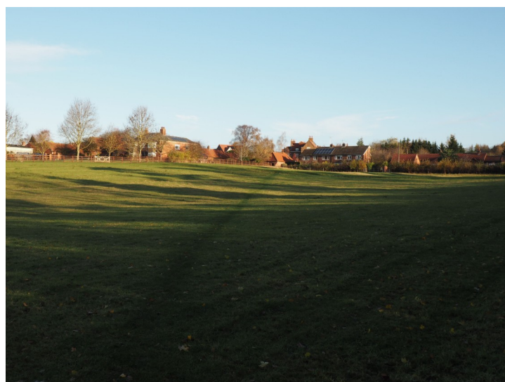
Looking north towards Normanton. NB the diagonal footpath.