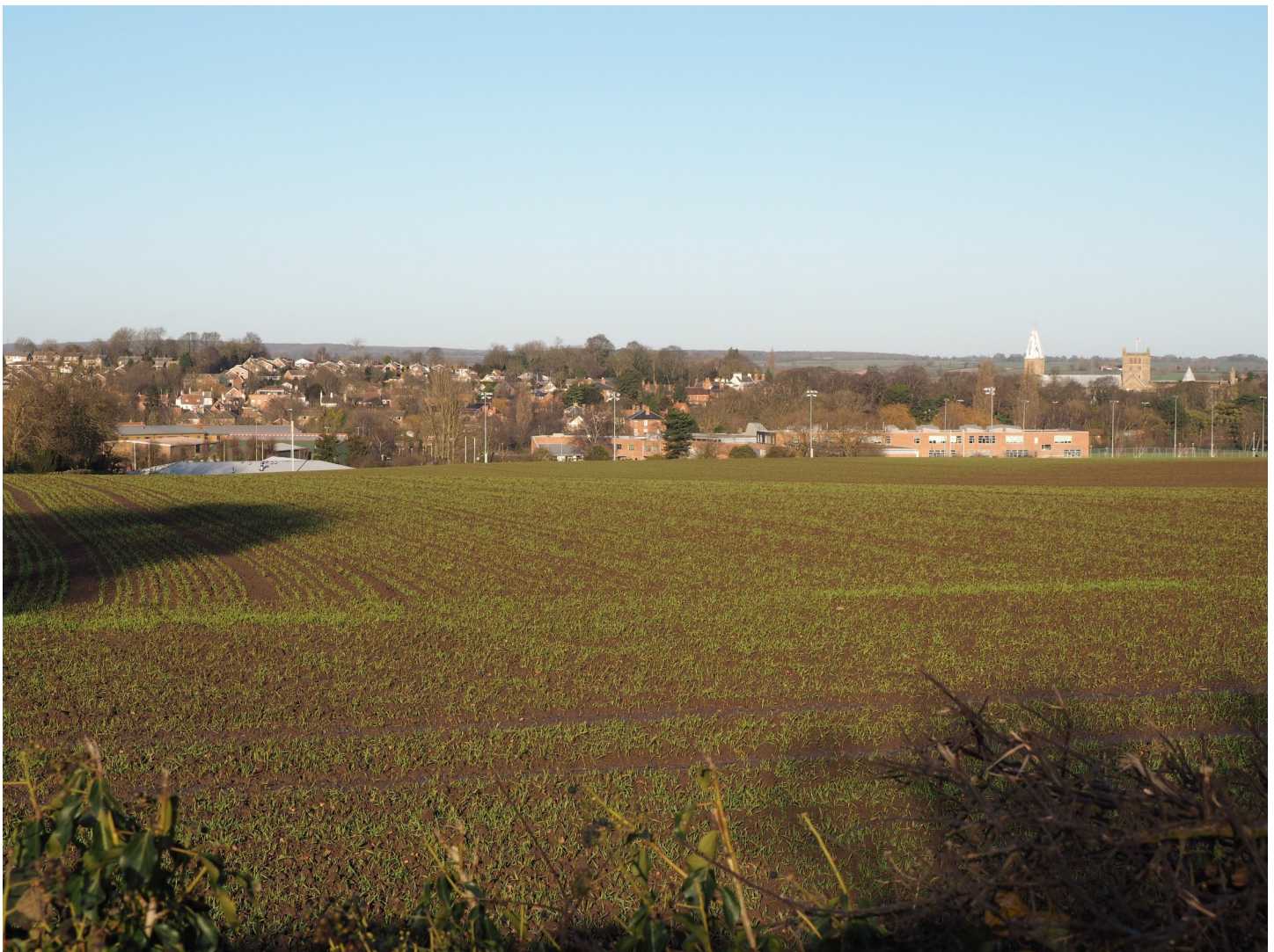
Looking north from Crink Lane with the Minster on the right and the Minster School just below it.