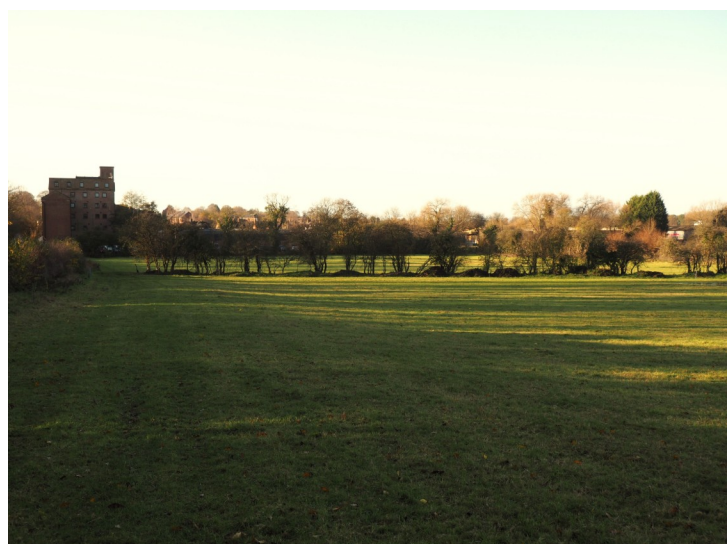
Looking SW towards Southwell. Greet Lily Mill is prominent on the left