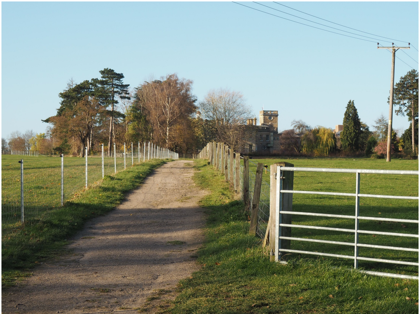
Looking west towards Brackenhurst Hall from the eastern boundary