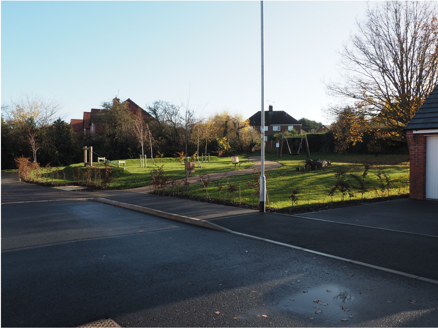
Looking South East towards High Town path