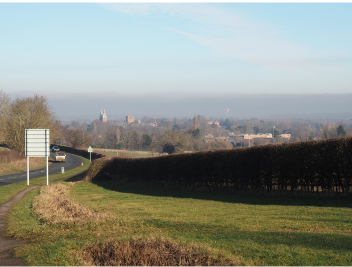
Looking north from Nottingham Road near the end of Stubbins Lane