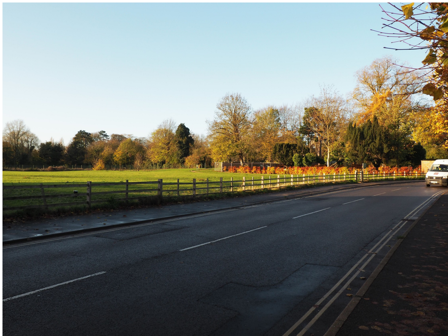
Looking west from Church Street (in the foreground). The grounds of the Archbishop's Palace and Vicar's Court are surrounded by the trees in the background.