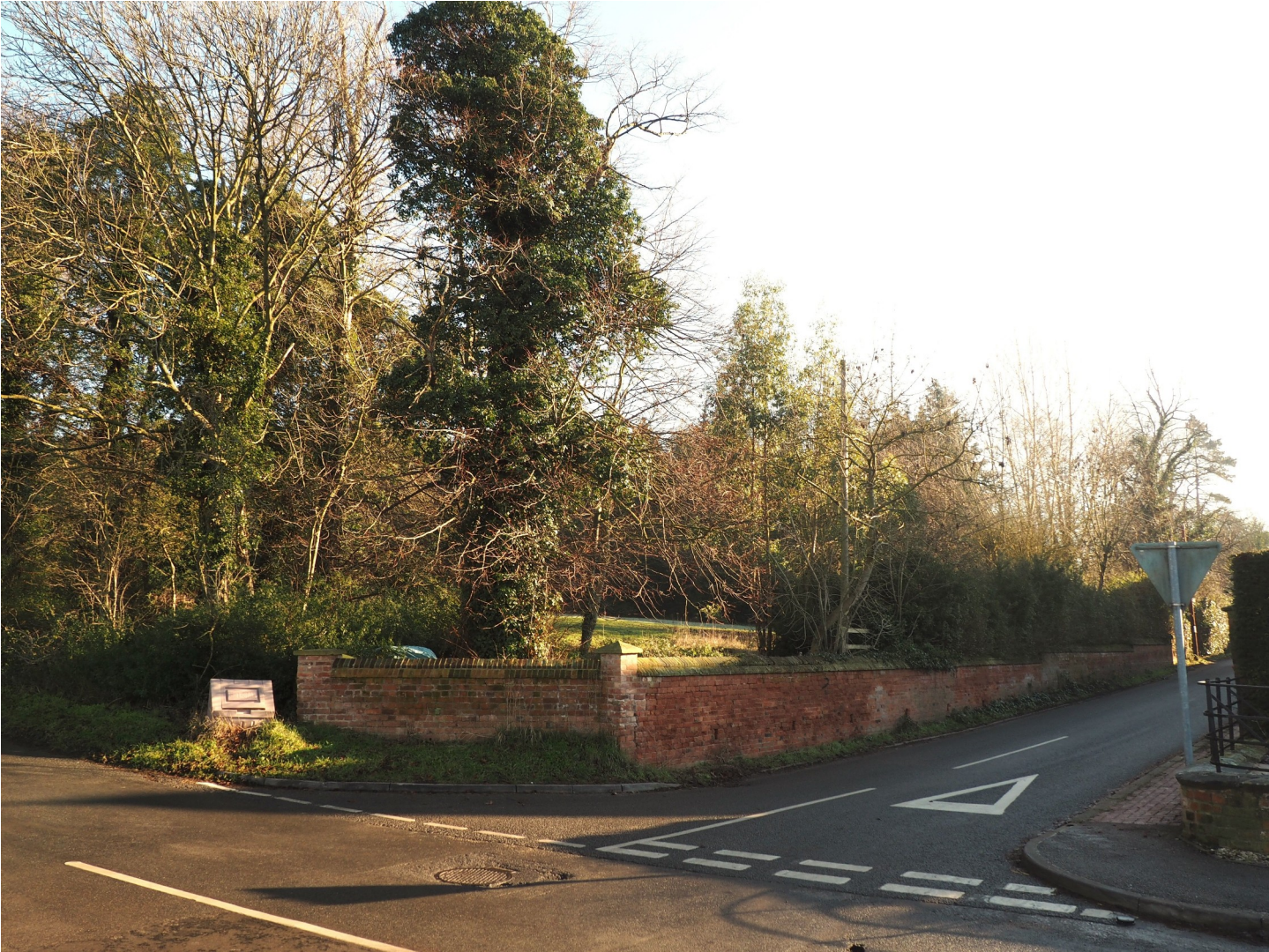
Looking East from Normanton Crossroads