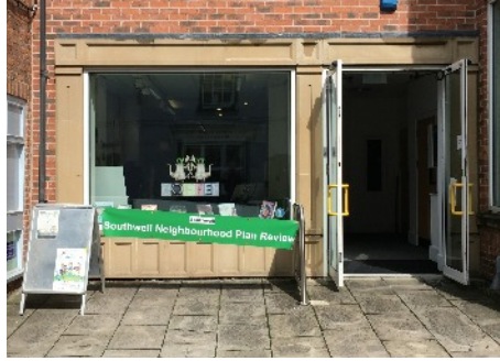
Library 11<sup>th</sup> July Library 15<sup>th</sup> July