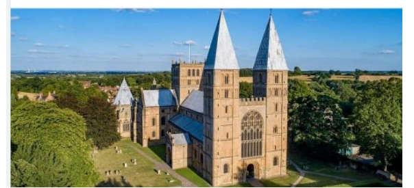
Southwell Community Chat Facebook Post