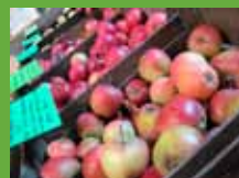
Apples from John Hemsall's Heritage Orchard

Their repertoire includes many popular English and Celtic set dances, with songs mixed in for good measure, all with their own original arrangements. They are looking forward to performing again at the Bramley Apple Festival in Southwell.