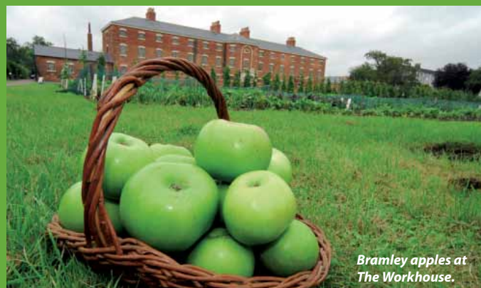
Bramley apples at The Workhouse.