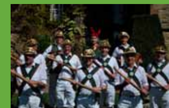
The Lord Conyers Morris Men

Members perform dances from the Cotswold region of England, the counties of Oxfordshire, Gloucestershire, Northamptonshire and Warwickshire, which form the mainstay of their repertoire. To these they have added dances from Lichfield in Staffordshire and Winstler in Derbyshire. Over the years they have gradually added further variants of dancing and customs that come under the general umbrella of Morris.