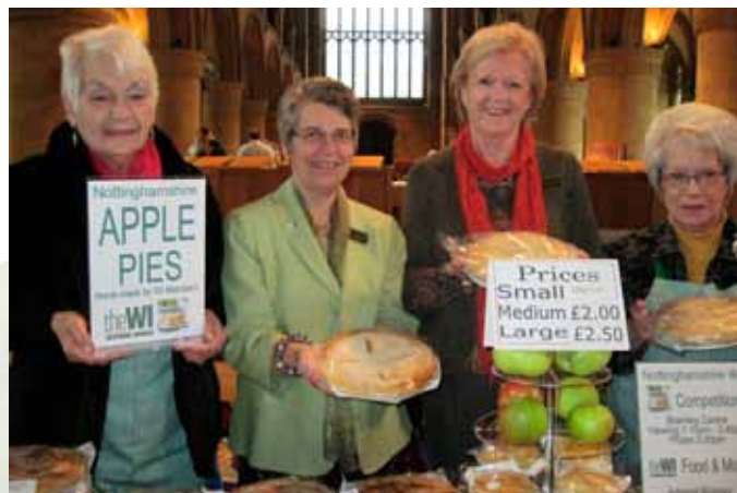
Members of the Women's Institute with their apple pie stall.